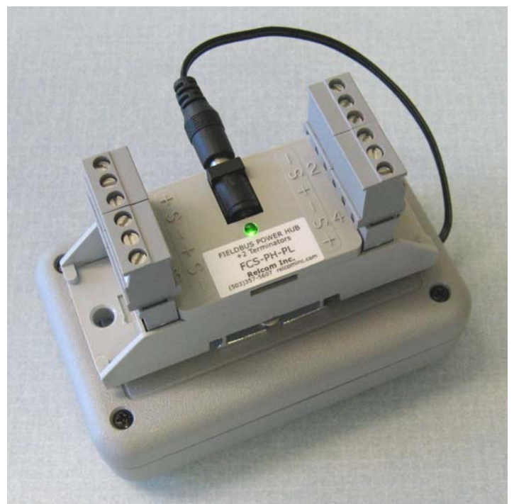
FCS-A11 with FCS-PH-PL (sold separately)

Product Specifications subject to change without notice.