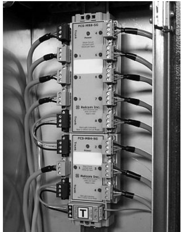
Fieldbus Junction box wired for 12 devices including a Terminator

All Megablock sizes can optionally have built-in Terminators eliminating the need to wire the external Terminator to the Megablock.